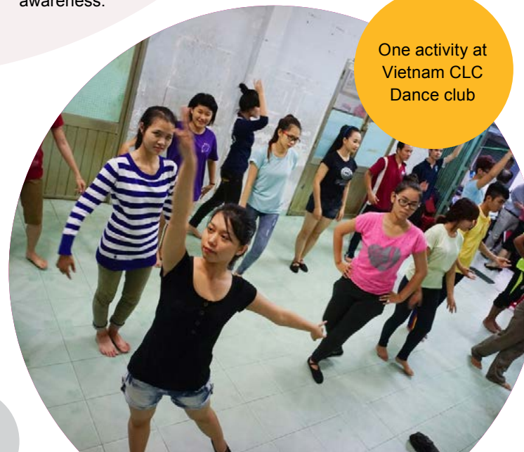
One activity at Vietnam CLC Dance club