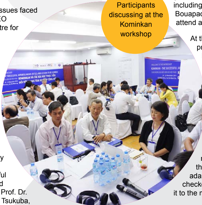
Participants discussing at the Kominkan workshop

The results of three working groups were some changes and recommendations are submitted to the draft. All participants agreed and adapted to the final draft which will be checked and edited again before sending it to the minister board in begin of July.