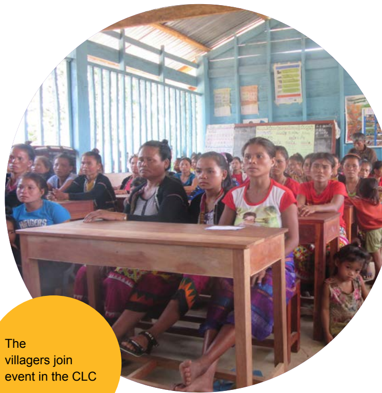
The villagers join event in the CLC

Moreover, in order to ensure and improve the delivery of relevant and effective non-formal education (NFE) services in target villages,