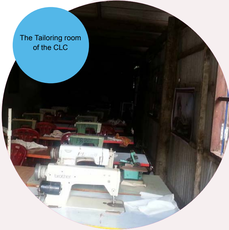
The Tailoring room of the CLC

So far Cambodia has 324 community learning centers (CLCs), of which 24 CLCs were managed by development partner (NGOs). The challenges include financial disbursement, it was difficult to select the skill teachers to respond to the need of community. This is to conclude the consideration of management, operation, and core curriculum to train as well as to consider the CLC Standard implementation.